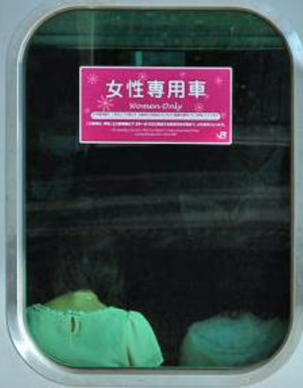
Japan, women-only train wagons