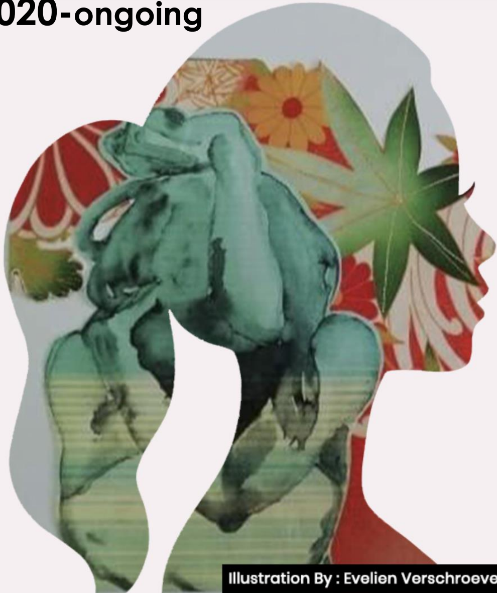
Illustration By : Evelien Verschroeven